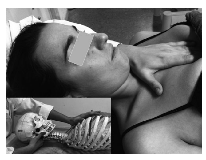
FIG. 3. Deep anterior cervical fascia release.

SPSS version 15 (SPSS Inc., Chicago, IL) was used for the statistical analyses. Data were expressed as mean (±standard deviation [SD]). A multivariate analysis of repeated measures (2 times×2 groups) was applied, based on the general linear model and applying the Grenhouse-Geisser